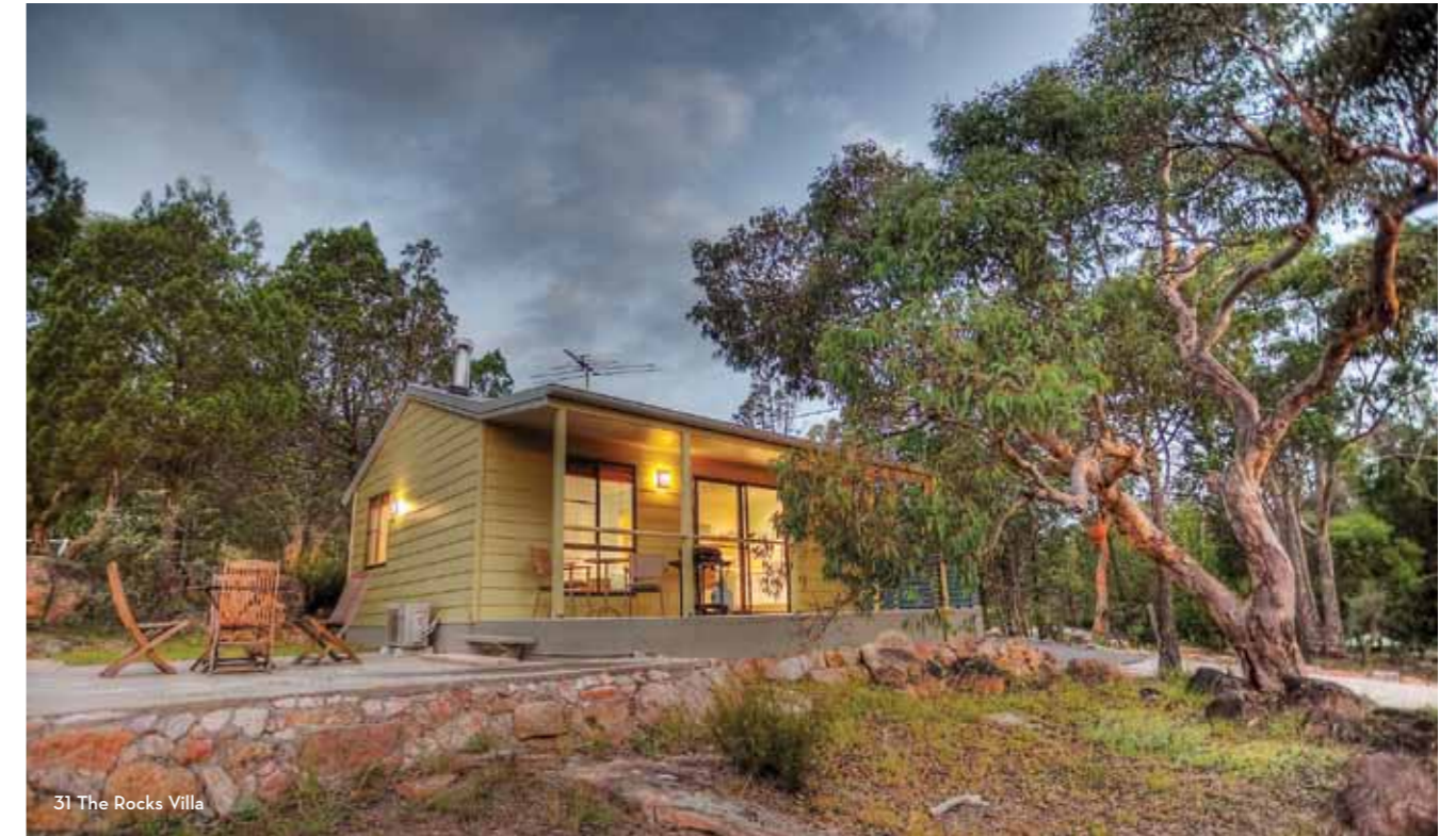
31 The Rocks Villa

Tiana Templeman discovers 10 Reasons to visit the Granite Belt