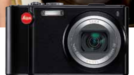
Model shown with the Leica DC-Vario-Elmar 4.1-49.2 mm f/3.3-4.9 ASPH. (equiv. 25-300 mm in 35-mm format) lens.

Explore the fascination of the Leica V-Lux 20 online at www.travel.leica-camera.com